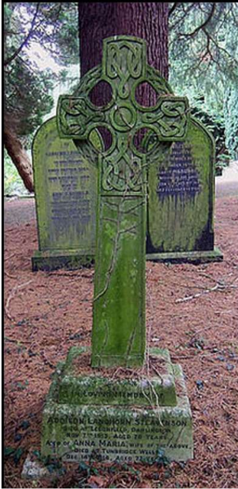
Gravestone at Darlington West Cemetery