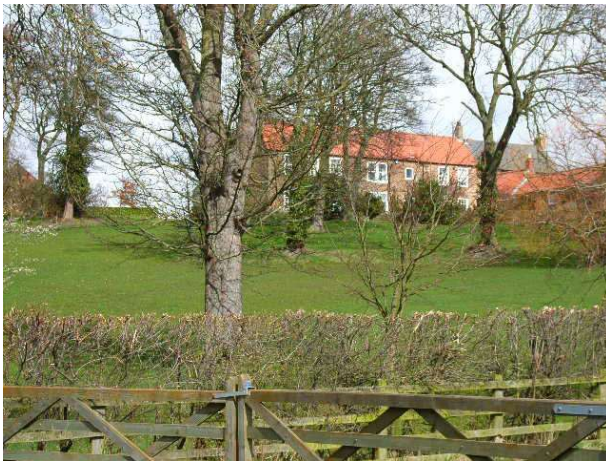
Above & Left: Holywell Hall

1891 Won award or his paper entitled 'Notes on the Present Position of the Question of Transmission of Power' as the institute acknowledged his academic efforts.