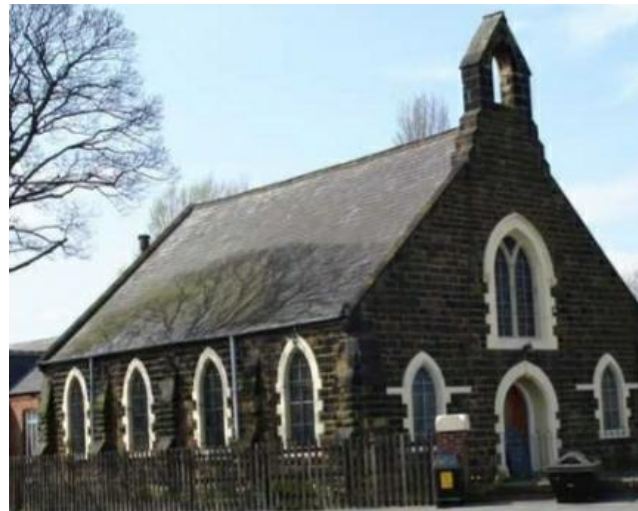
Fig.8. Eston Congregational Chapel. Jubilee Road. Eston.